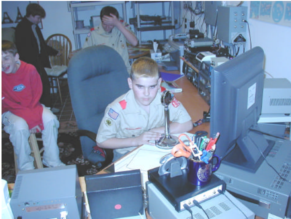
"I think he's calling me..."