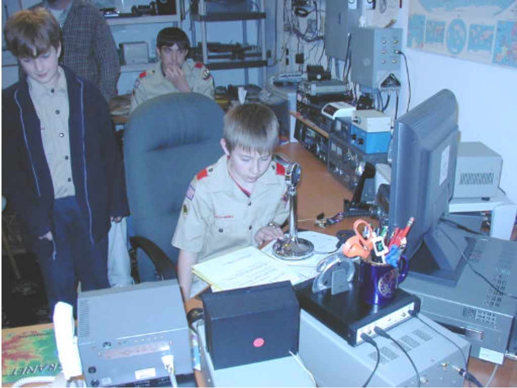
"You're five and nine. Good luck in the contest..."