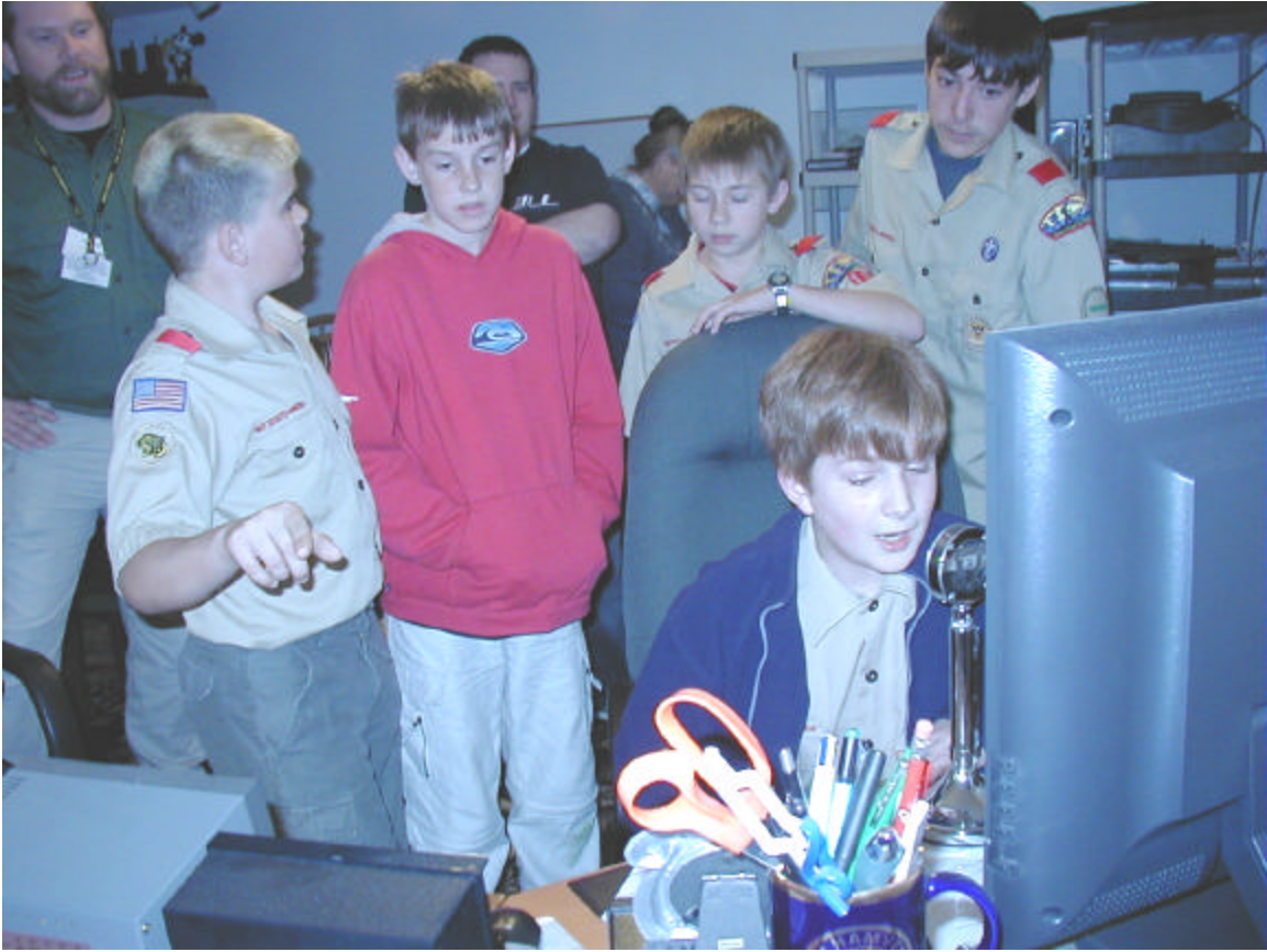
“Seventy-three Old Man...”