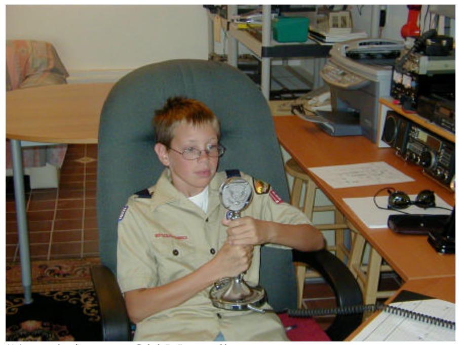
"Armchair copy Old Man..."