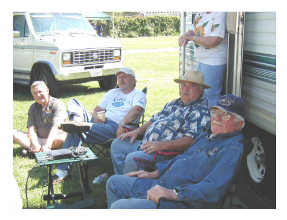
Field Day can be pretty exhausting...