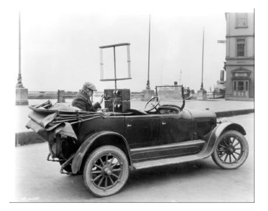
Larry W7CB's first Field Day operation.