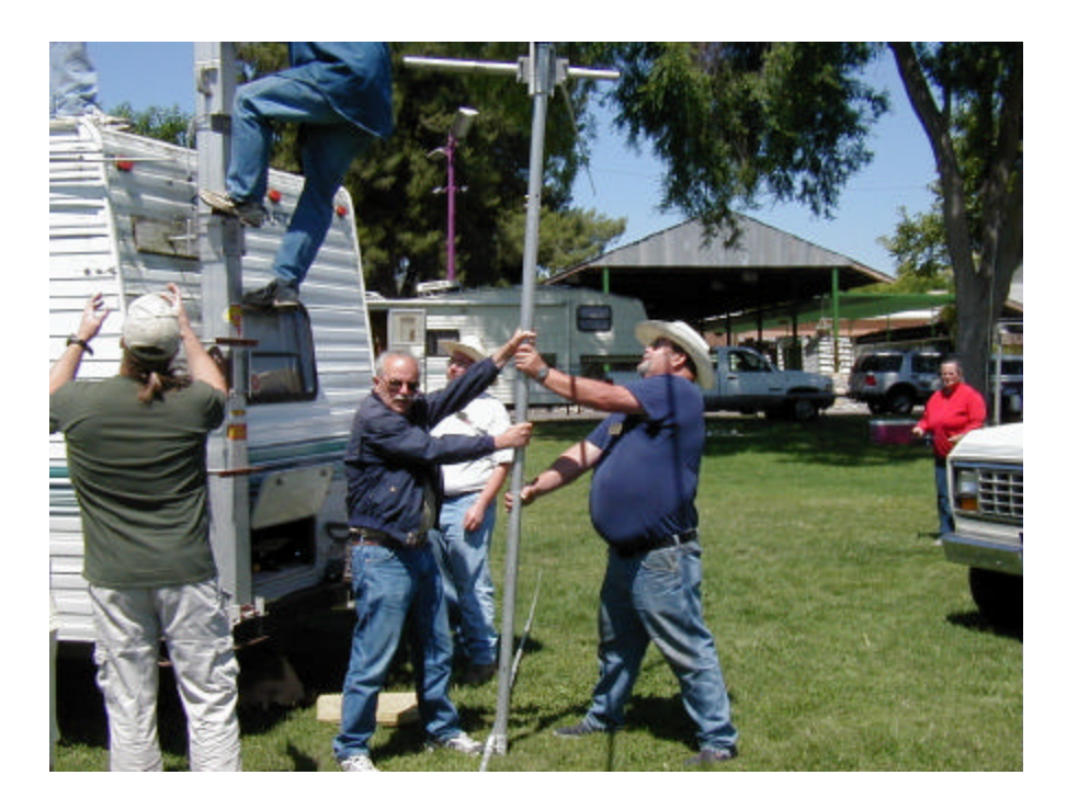
"All hands" antenna disassembly.