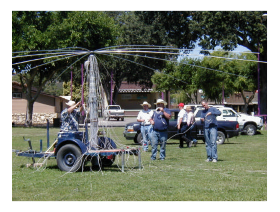
The Discone gets disassembled. 32 radials.