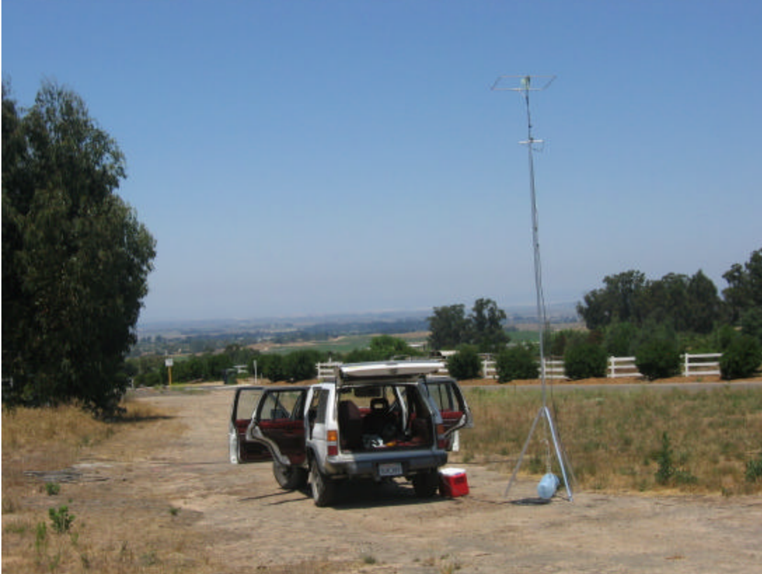
CM94tu near Orcutt, 777', 16 Jul 06

So I made a total of 20 contacts in 8 grid squares, from 5 different grid squares, claimed score 450, about 400 miles traveled. This wasn't much of a score, but I had fun. I plan on operating next in the ARRL UHF contest on 5-6 August, 2006, and if I finish my transverter in time, the ARRL 10 Ghz and Up contest on 19-20 Aug.