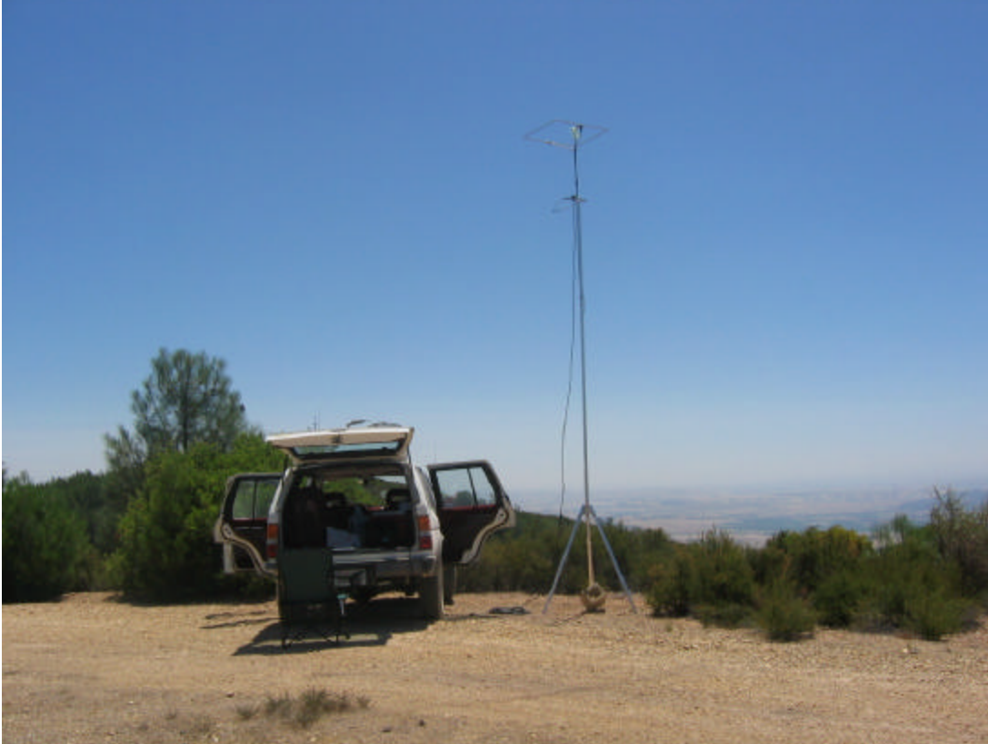
Williams Hill, CM95mw, 2665', 15 Jul 06.

My next planned grid square was DM05ax, over towards the intersection of Highway 41 and US 5, by Kettleman City. I got there and set up at about 1600 PST. I arrived in the middle of a giant opening on 6M, double hop to the east coast. Awesome! I made a number of long distance 6M contacts, and a couple of 2M ones.