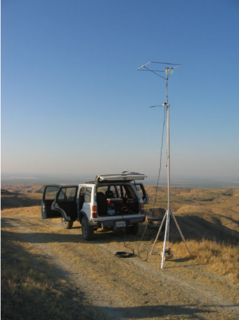
CM96wa near Avenal, 1310', 15 Jul 06.